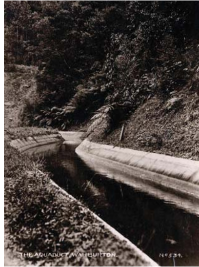
STATE LIBRARY OF VICTORIA