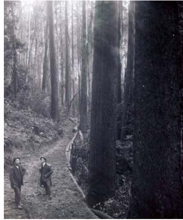
STATE LIBRARY OF VICTORIA